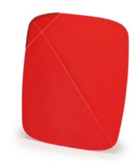
Folding Chopping Board 80018 - Red