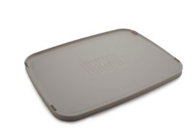
Multi-function Chopping Board with meat grip 80086 - Grey