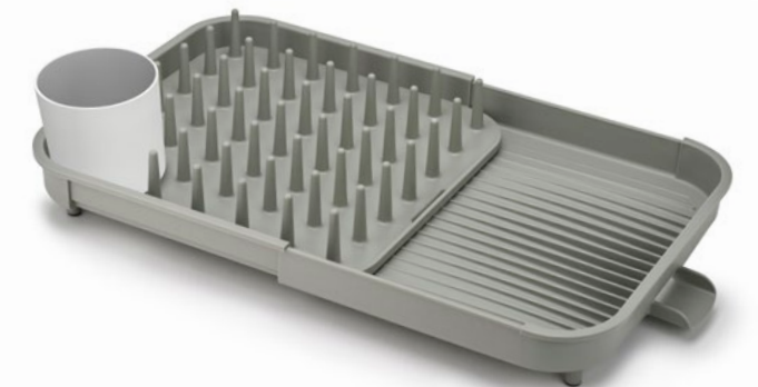
Expanding Dish Rack with moveable utensil pot 80071