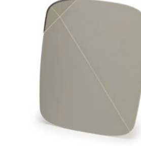
Folding Chopping Board 80019 - Grey