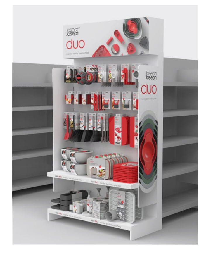
Bay End Display (Image for reference only)

Disposable Floor-standing Merchandiser (Image for reference only)