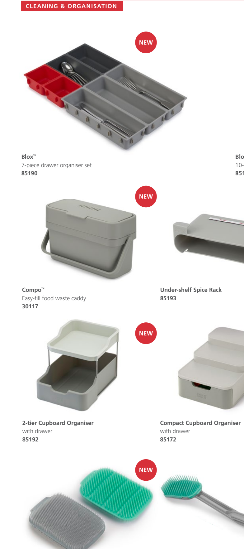
CleanTech<sup>™</sup> Washing-up Scrubber (2-pack) 85174