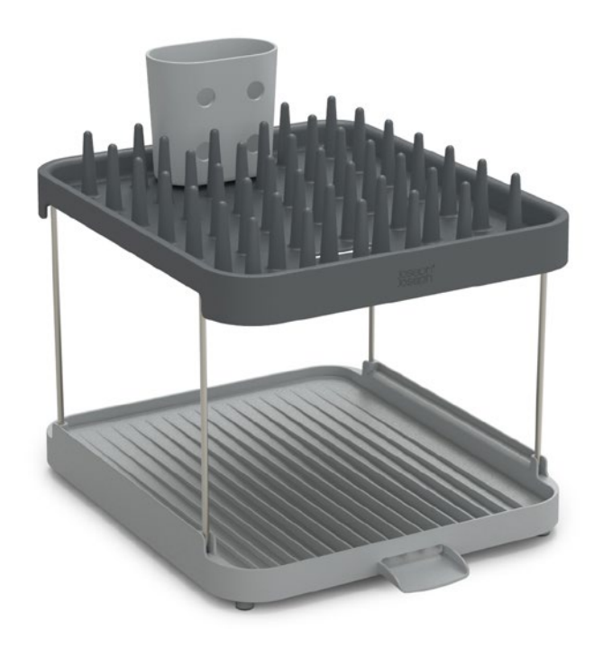
2-tier Dish Rack with moveable utensil pot 85150