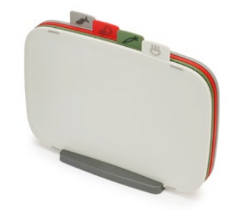
4-piece Chopping Board Set with index-style tabs 80017