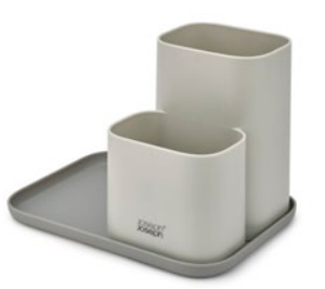
Kitchen Worktop Organiser 80076