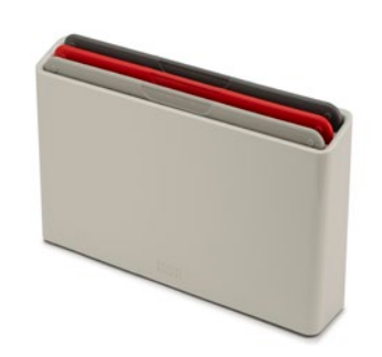
3-piece Chopping Board Set with storage case 60179