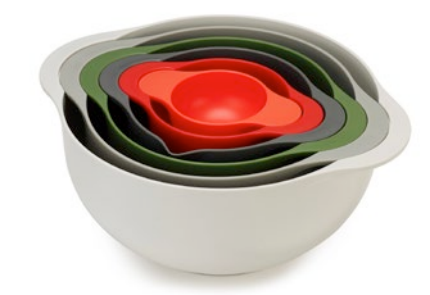
6-piece Food Preparation Bowl Set 80025