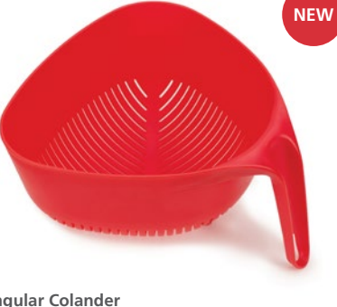
Triangular Colander with easy-pour corners 20160