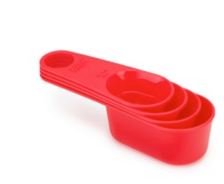
4-piece Measuring Cup Set with clip-together handles 80020