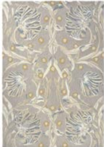
Pure Pimpernel 028701 Linen

PURE TRELLIS PURE PIMPERNEL Handtufted Pure new wool/viscose 140 x 200 cm 170 x 240 cm 200 x 280 cm 250 x 350 cm 4'7" x 6'7" 5'7" x 7'10" 6'7" x 9'2" 8'2" x 11'6" Custom sizes on request