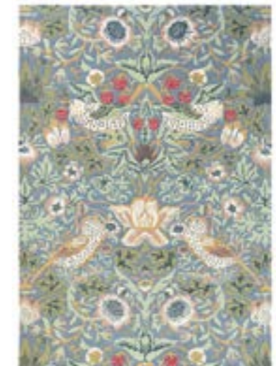
Strawberry Thief 027718 Slate

STRAWBERRY THIEF Handtufted Pure new wool