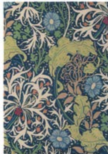
Seaweed 28008 Ink