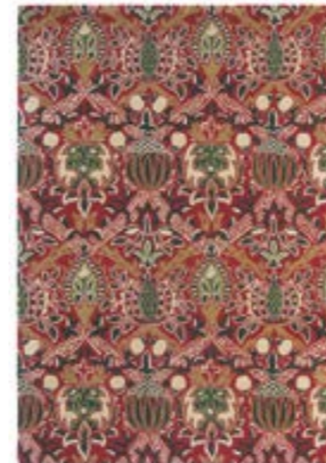
Granada 27600 Red / Black