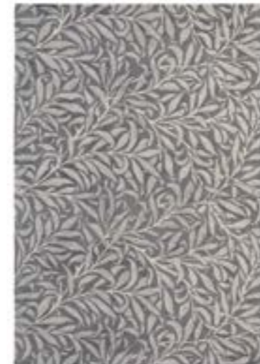
Willow Bough 28305 Granite