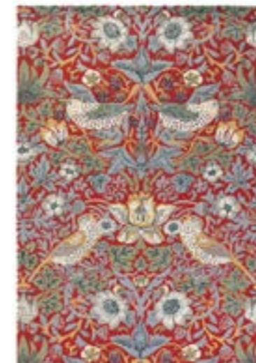
Strawberry Thief 027700 Crimson