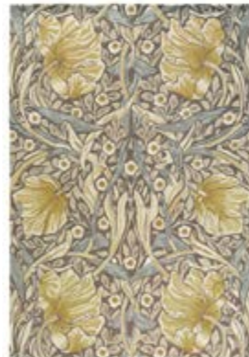
Pimpernel 028808 Bullrush