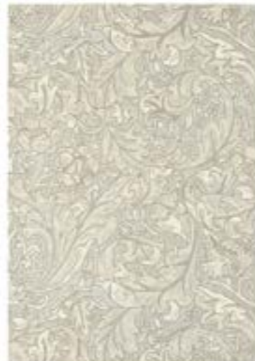
Bachelors Button 28209 Linen

BACHELORS BUTTON Handtufted Pure new wool 140 x 200 cm 170 x 240 cm 200 x 280 cm 250 x 350 cm 4'7" x 6'7" 5'7" x 7'10" 6'7" x 9'2" 8'2" x 11'6"