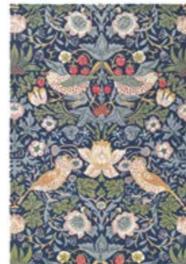
Strawberry Thief 027708 Indigo