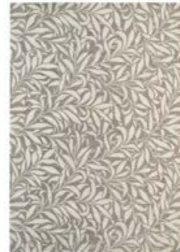
Willow Bough 28304 Mole