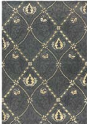
Pure Trellis 029105 Black Ink