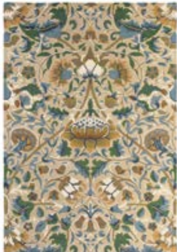
Lodden 27801 Manilla