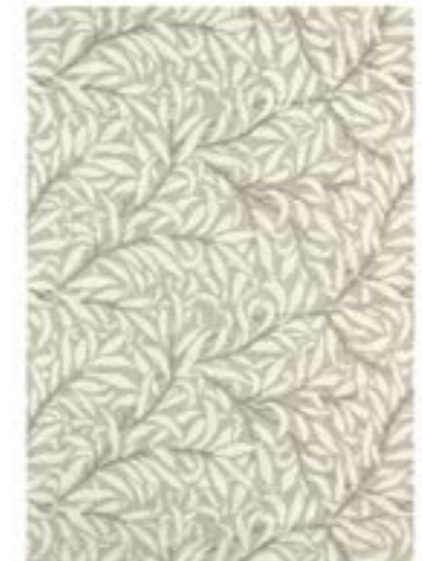
Willow Bough 28309 Ivory

WILLOW BOUGH Handtufted Pure new wool/viscose 140 x 200 cm 170 x 240 cm 200 x 280 cm 250 x 350 cm 4'7" x 6'7" 5'7" x 7'10" 6'7" x 9'2" 8'2" x 11'6"