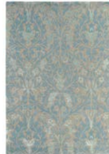
Autumn Flowers 27508 Eggshell