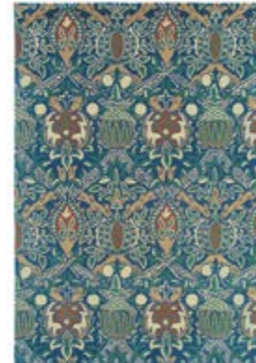
Granada 27608 Indigo / Red