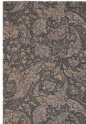
Bachelors Button 28205 Charcoal

London Showroom Chelsea Harbour Design Centre - London SW10 0XE t + 44 844 543 4749 - showroom@stylelibrary.com