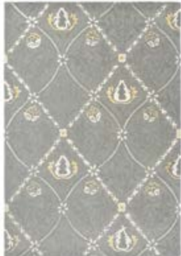
Pure Trellis 029104 Lightish Grey