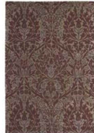
Autumn Flowers 27500 Plum

AUTUMN FLOWERS Handtufted Pure new wool/viscose