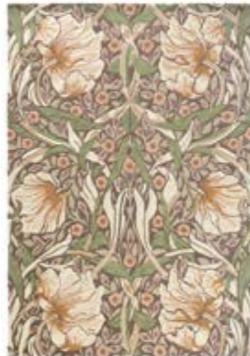
Pimpernel 028805 Aubergine

PIMPERNEL Handtufted Pure new wool 140 x 200 cm 170 x 240 cm 200 x 280 cm 250 x 350 cm 4'7" x 6'7" 5'7" x 7'10" 6'7" x 9'2" 8'2" x 11'6"