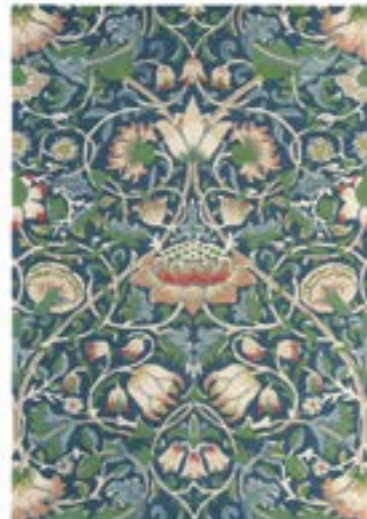
Lodden 27808 Indigo / Mineral