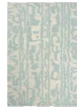
Waterwave Stripe Pearl 039908