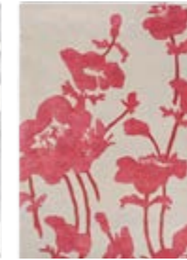
Floral 300 Poppy 039600