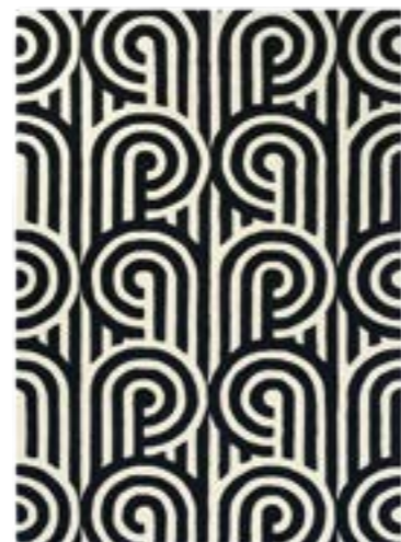
Turnabouts Black 039205