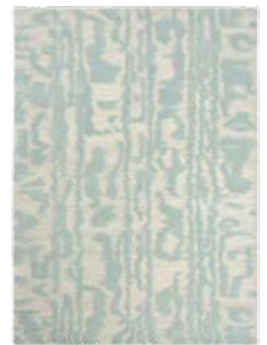
Waterwave Stripe Pearl 039908