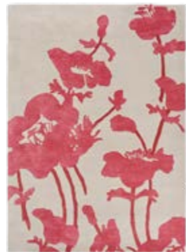
Floral 300 Poppy 039600