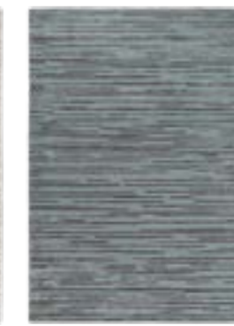
Slub Charcoal 039405

Made and distributed by Brink and Campman Albert Schweitzerstraat 3 - 7131 PG Lichtenvoorde - The Netherlands p.o. box 180 - 7130 AD Lichtenvoorde - The Netherlands t + 31(0) 544 390 400 - f + 31(0) 544 390 470 info@brinkandcampman.com - www.brinkandcampman.com