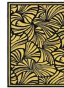
Japanese Fans Gold 039305