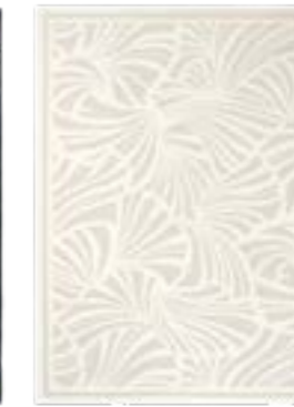
Japanese Fans Ivory 039301