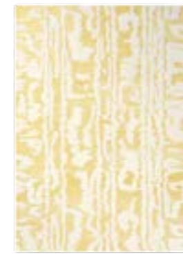
Waterwave Stripe Citron 039906