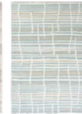
Tortoiseshell Stripe Jade 039808