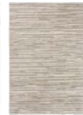
Slub Mist 039401