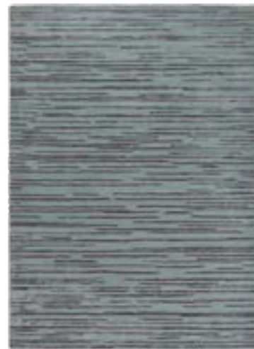
Slub Charcoal 039405