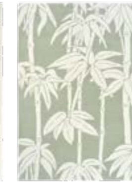
Japanese Bamboo Jade 039507