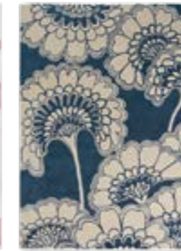
Japanese Floral Midnight 039708