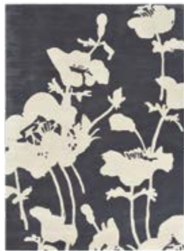
Floral 300 Charcoal 039604