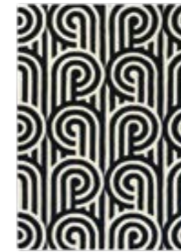
Turnabouts Black 039205