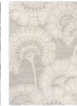
Japanese Floral Oyster 039701