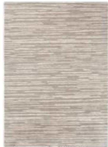
Slub Mist 039401

For the full range of Florence Broadhurst products in your territory visit www.florencebroadhurst.com or email info@signaturedesignarchive.com