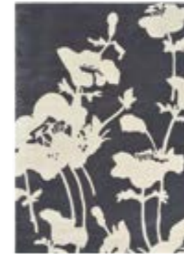
Floral 300 Charcoal 039604