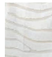
509 Bianco Lana