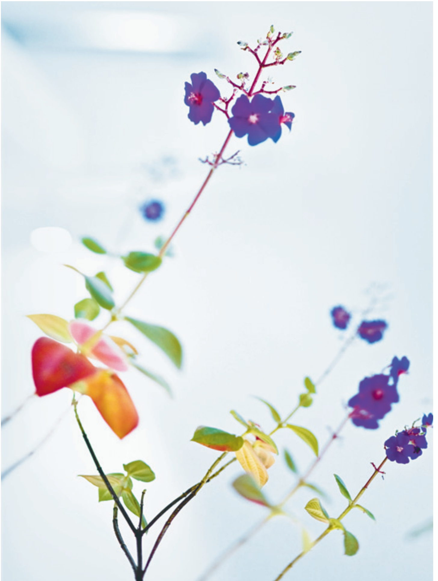
The fusion of different elements, shapes and functions creates a harmonious overall impression, masterfully combining innovative functionality with visionary design.