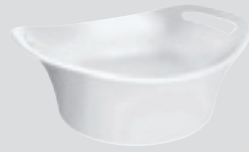
Wash bowl 500 mm, molded mineral, (only in conjunction with basin mixers without pull rod) # 11301000