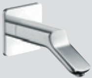
Bath spout 171 mm # 11430000