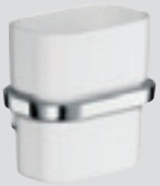
Toothbrush tumbler with holder # 42434000