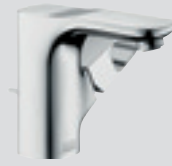
Single lever basin mixer for small basins # 11025000