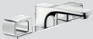
3-hole basin mixer with plate # 11040000*