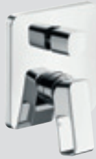
Single lever basin mixer for concealed installation Finish set # 11425000 Single lever basin mixer for concealed installation, with Safety function Finish set # 11426000 Basic set iBox® universal # 01800180