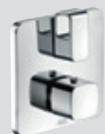
Thermostat for concealed installation with shut-off valve Finish set # 11732000 Basic set iBox® universal # 01800180