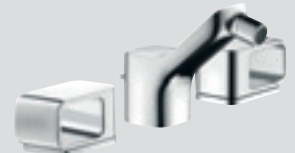
3-hole bidet mixer # 11223000