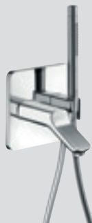
Bath spout/porter combination # 11435000 Basic set iBox® universal # 01800180