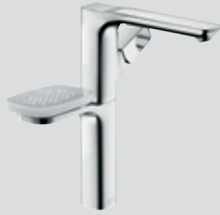
Single lever basin mixer for wash bowls # 11023000 Single lever basin mixer for wash bowls without waste # 11034000