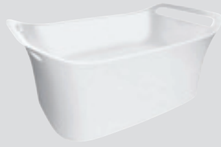
Wash basin 625 mm, wall-mounted, molded mineral # 11302000