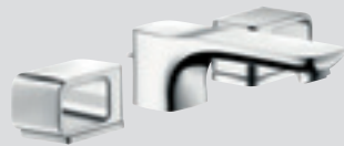
3-hole basin mixer without plate # 11041000