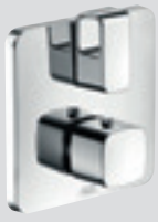
Thermostat for concealed installation with shut-off and diverter valve Finish set # 11733000 Basic set iBox® universal # 01800180