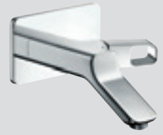
Single lever basin mixer for concealed installation # 11026000 Basic set (not shown) # 10902180