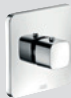
Thermostat for concealed installation Finish set # 11730000 Highflow Thermostat for concealed installation # 11731000 Basic set iBox® universal # 01800180