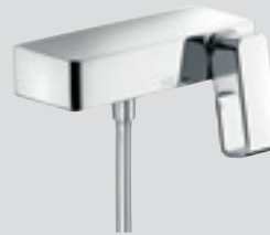
Single lever shower mixer for exposed fitting # 11620000