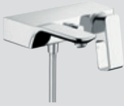
Single lever bath mixer for exposed fitting # 11420000