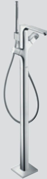
Freestanding thermostatic bath mixer # 11422000 Basic set (not shown) # 10452180