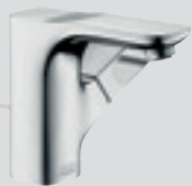
Pillar tap # 11120000