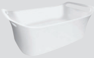
Wash bowl 625 mm, molded mineral, (only in conjunction with basin mixers without pull rod) # 11300000