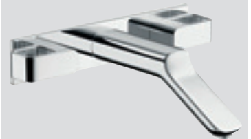
3-hole wall-mounted basin mixer, concealed installation spout 228 mm projection # 11043000 Basic set (not shown) # 10303180

*Only applicable on even, smooth surfaces.