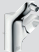
Single lever bidet mixer # 11220000