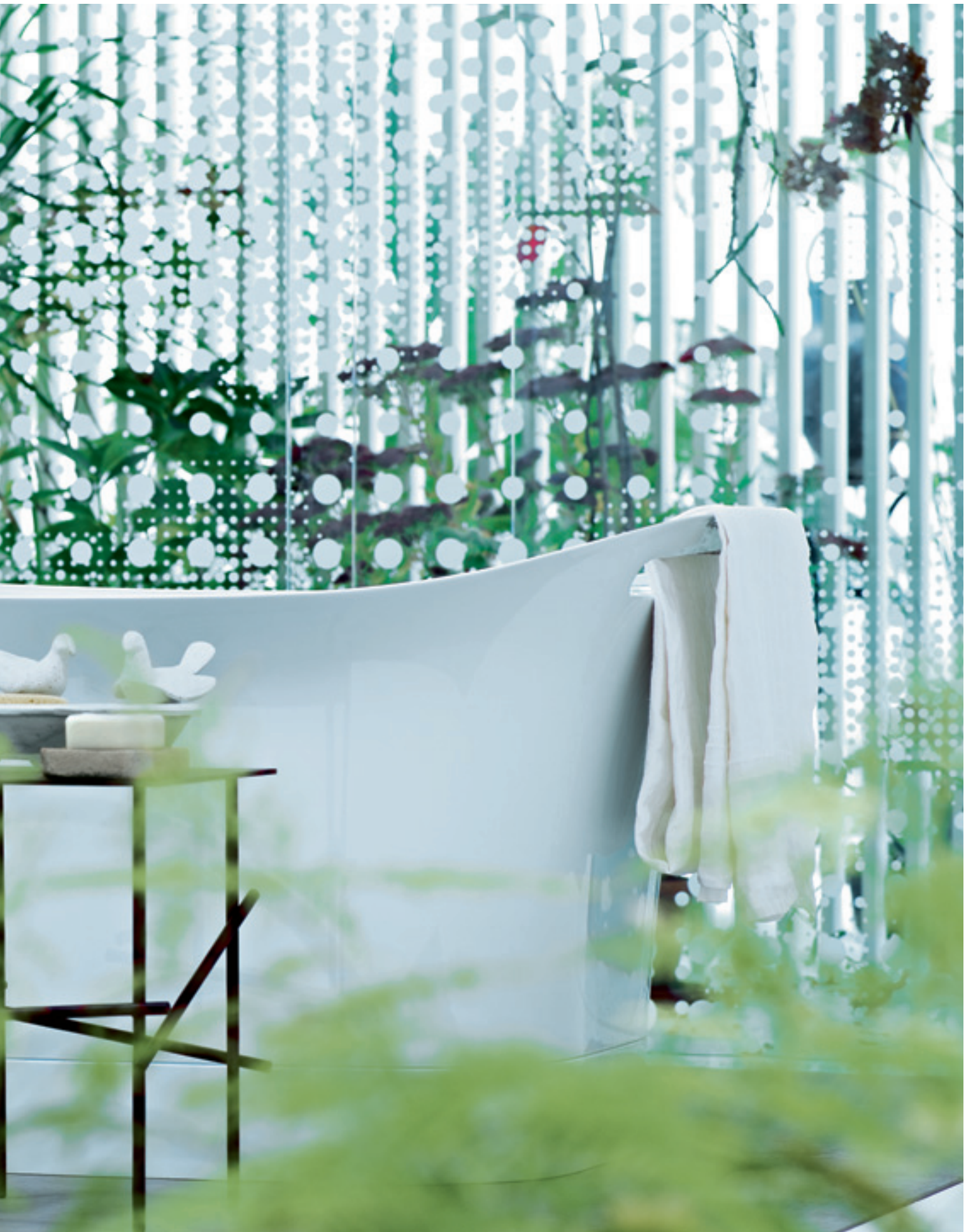
Time to indulge in memories: The shape of the bath tub and the wash bowls is inspired by an antique zinc wash tub. The integrated handles serve as convenient towel holders.