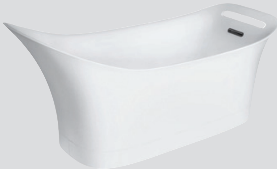
Bath tub 1800 mm, free-standing, mineral molded, incl. waste and overflow set, Filling capacity approx. 180 l (1 person 70 kg) # 11440000