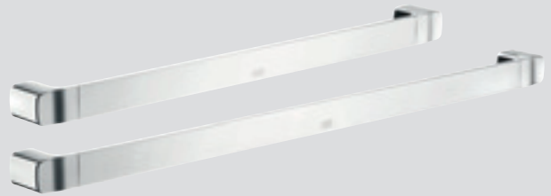
Bath towel rail External dimensions 640 mm # 42460000