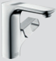
Single lever basin mixer # 11020000 Single lever basin mixer without waste # 11021000 Single lever basin mixer with copper pipes # 11022000