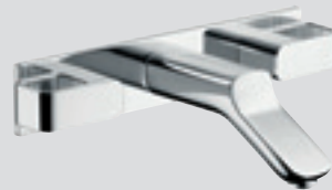
3-hole wall-mounted basin mixer, concealed installation spout 168 mm projection # 11042000 Basic set (not shown) # 10303180