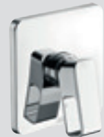
Single lever shower mixer for concealed installation Finish set # 11625000 Basic set iBox® universal # 01800180