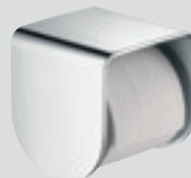
Roll holder # 42436000