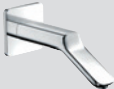
Bath spout 231 mm # 11431000