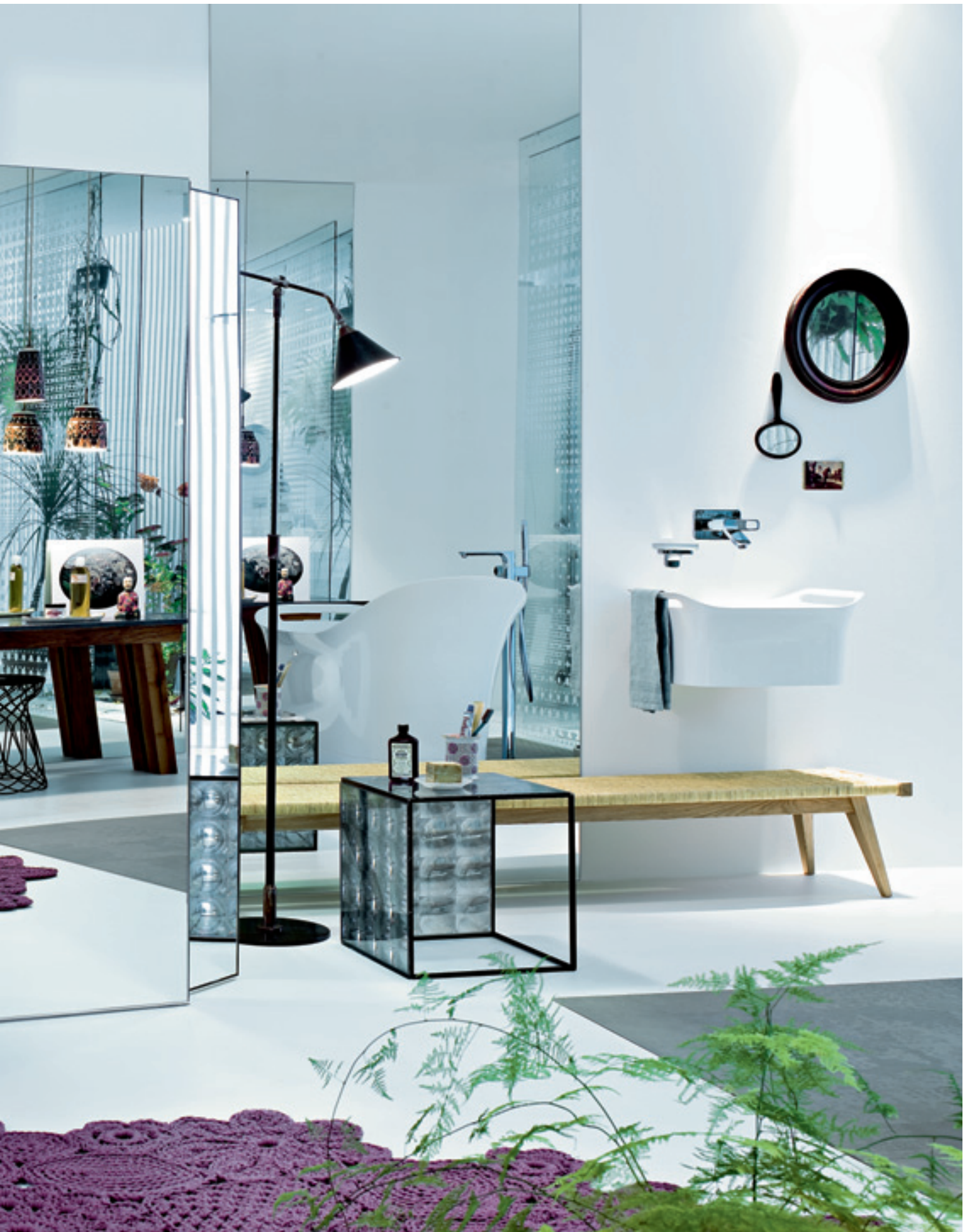
Far more than just a partition: With the modular, flexible partition elements nearly any wish can be fulfilled – from an intimate, personal screen to a wall-mounted or free-standing heater.