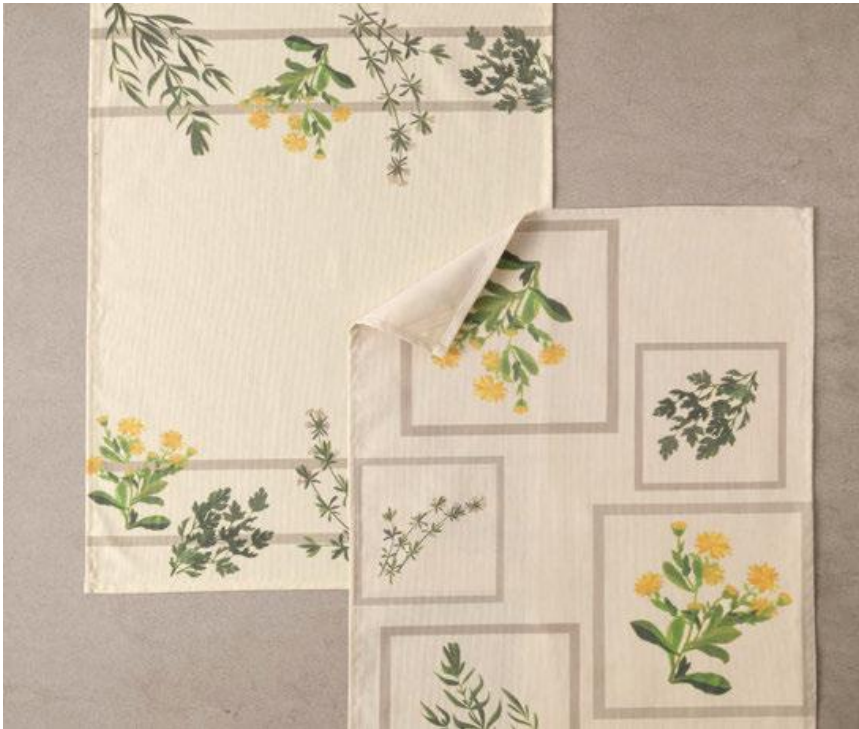
HERBARIUM DIS. 20124