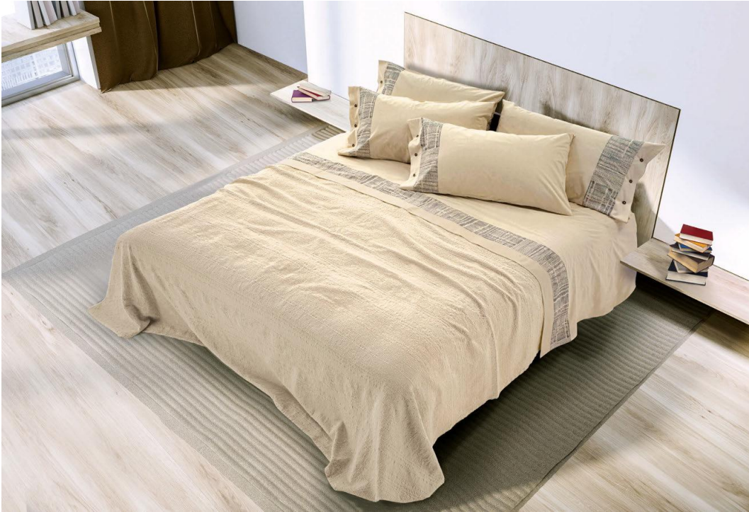
PONENTE DIS. 20459