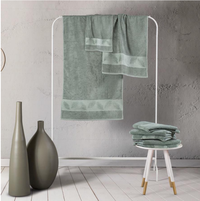
FELCI DIS. 20464

Weight: 500 gr/mq set 1+1 (cm 60x110 + cm 40x60) Bath sheet cm 100x150