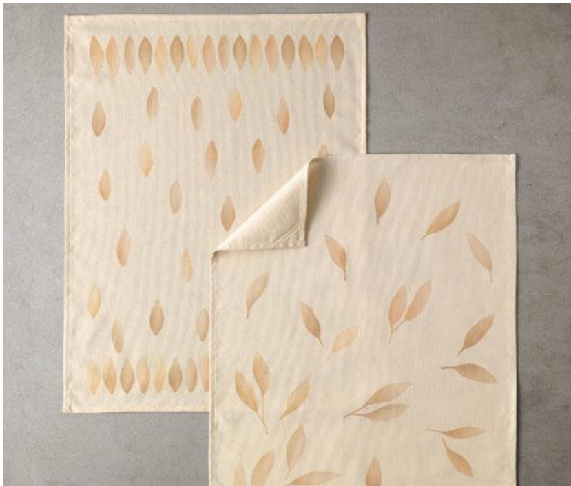
CASCATA DIS. 20050

On panama cotton, digital printed - 9 set of 50x75