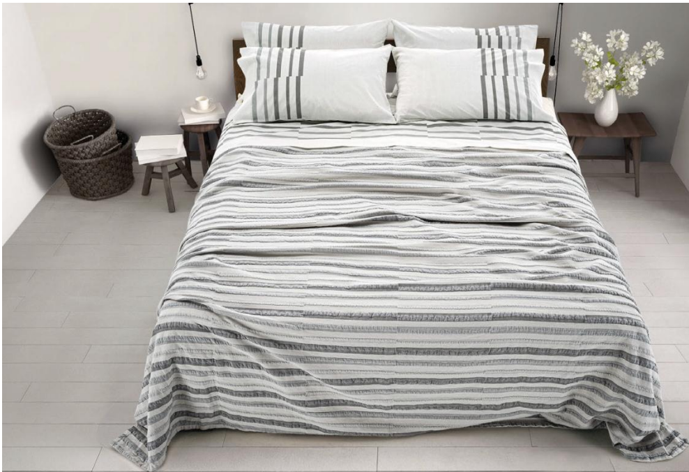
SOLANO DIS. 20460