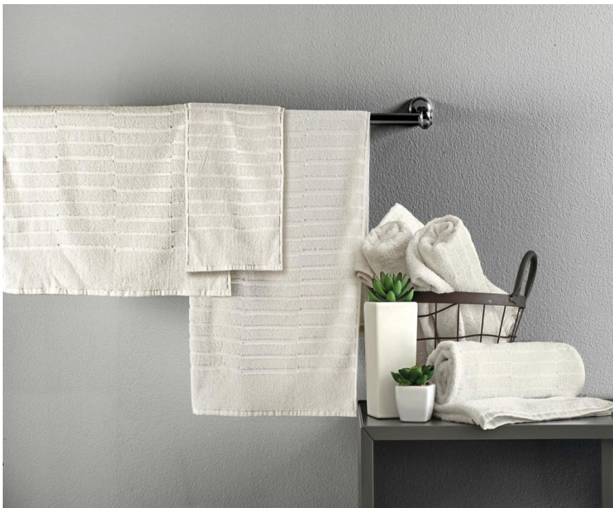
SOLANO DIS. 20460

Weight: 500 gr/mq set 1+1 (cm 60x110 + cm 40x60) Bath sheet cm 100x150