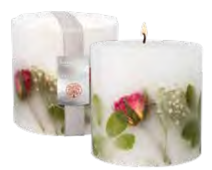
6753 Pillar Candle 95 x 95mm 60 hrs (pk/4)