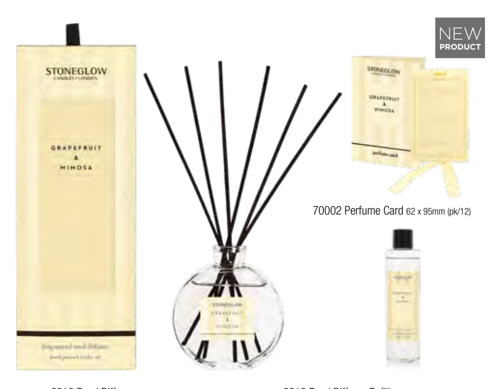
6812 Reed Diffuser 120ml 12 weeks (pk/6)