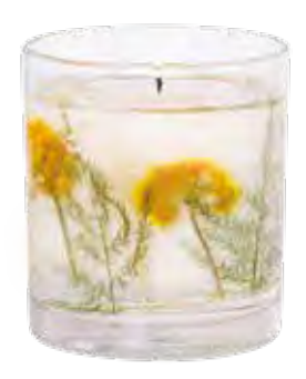
70038 Natural Wax Tumbler 90 x 80mm 15 hrs (reusable) (pk/6)