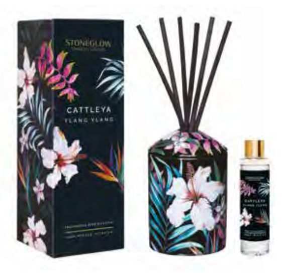
6893 Reed Diffuser 200ml 16 weeks (pk/6)