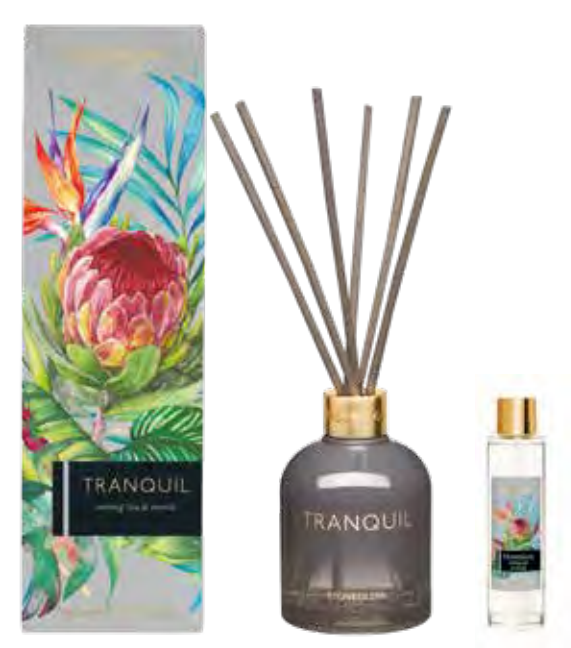
6695 Reed Diffuser 150ml 12 weeks (pk/6)