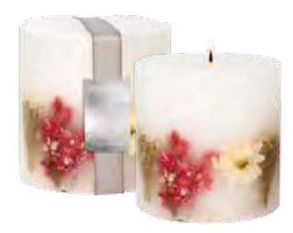
6843 Pillar Candle 95 x 95mm 60 hrs (pk/4)