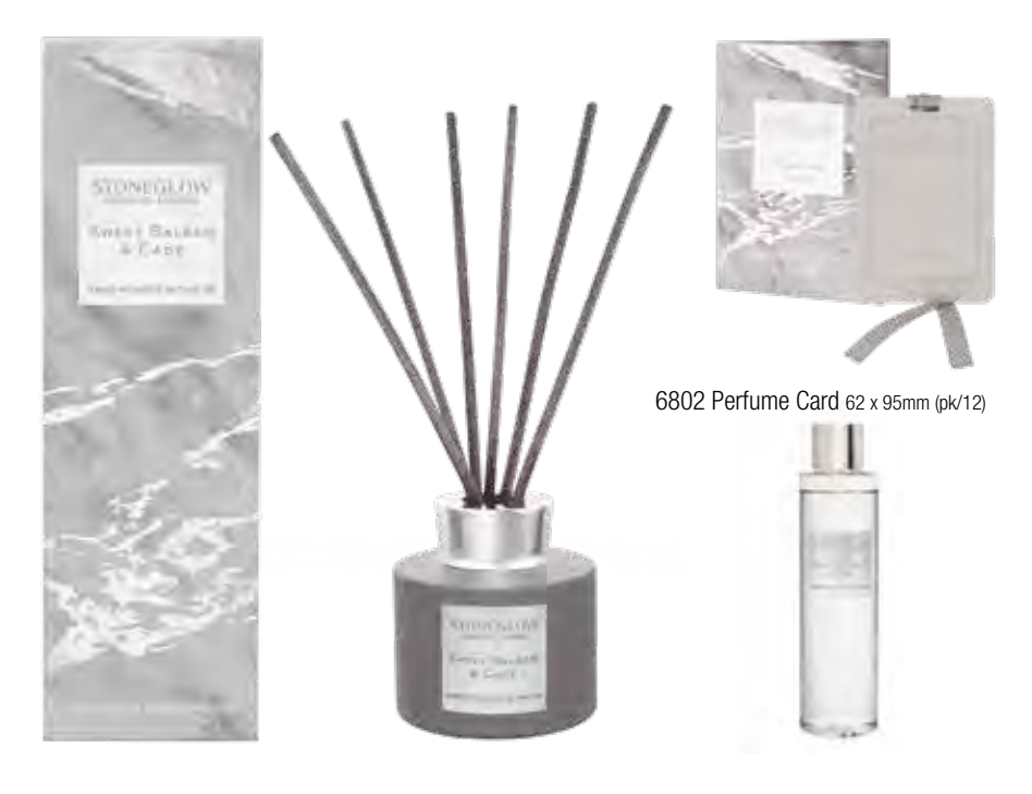
6665 Reed Diffuser 120ml 10 weeks (pk/6)