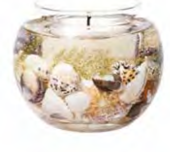
6553 Natural Wax Fishbowl 100mm Dia 15 hrs (reusable) (pk/4)