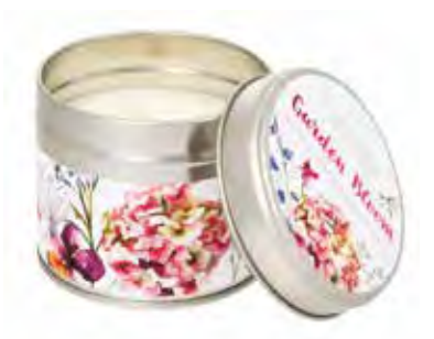
6838 Natural Wax Candle Tin 78 x 75mm 25 hrs (pk/6)