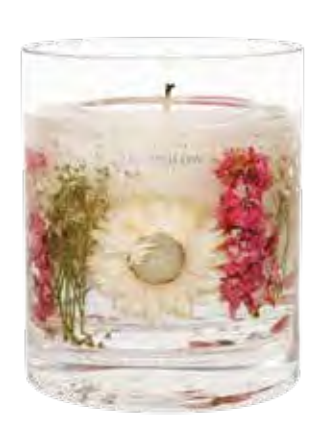
6847 Natural Wax Gel Candle 120 x 100mm 30 hrs (pk/2)

A citrus bed of lemon, bergamot, grapefruit and orange, entwined with soft geranium leaves, rose and peony petals, for a soft feminine aroma.