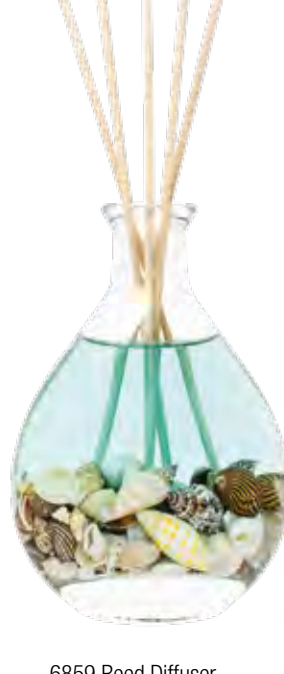
6859 Reed Diffuser 200ml 16 weeks (pk/6)