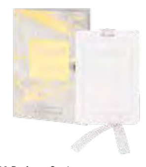
6800 Perfume Card 62 x 95mm (pk/12)