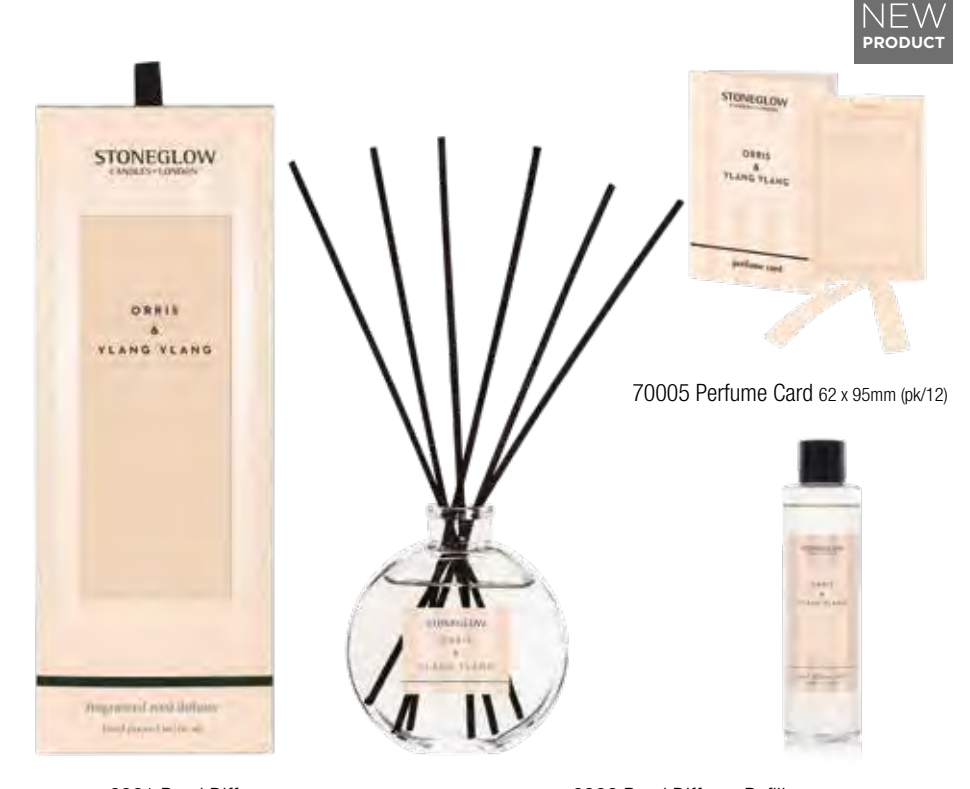
6821 Reed Diffuser 120ml 12 weeks (pk/6)