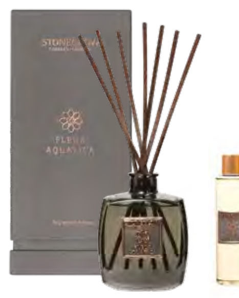
6042 Reed Diffuser 200ml 16 weeks (pk/6)