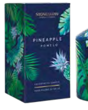
6874 Tumbler 150 x 85mm 60 hrs (pk/6)

Punchy pineapple, tangerine and pomelo bring fresh citrusy notes whilst mellow coconut and juicy peach deliver a touch of sweetness. A sensual base of amber and musk help evoke warm, exotic nights. A tropical island delight.