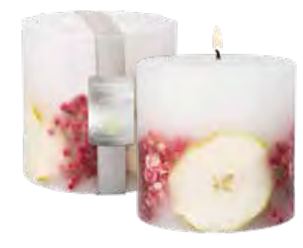
6755 Pillar Candle 95 x 95mm 60 hrs (pk/4)