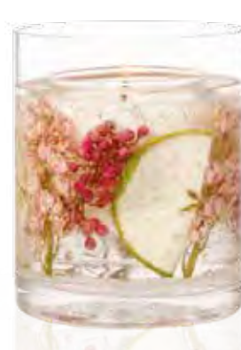
6849 Natural Wax Gel Candle 120 x 100mm 30 hrs (pk/2)