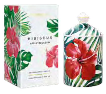
6872 Tumbler 150 x 85mm 60 hrs (pk/6)

Juicy peach and crisp apple complement lotus flower and water lily in this heavenly blend. Warming vanilla and cedar bring an earthy muskiness that helps you relax and unwind.