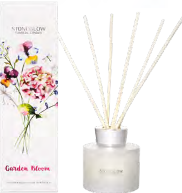
6542 Reed Diffuser Refill 200ml 16 weeks (pk/6)