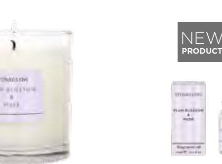
70016 Fragrance Oil 15ml (pk/12)