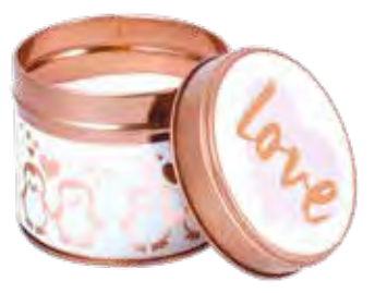
Fragrance: Cranberry 70054 Candle Tin 78 x 75mm 25 hrs (pk/6)