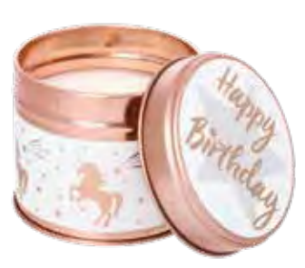
Fragrance: Pineapple & Tangerine 6797 Candle Tin 78 x 75mm 25 hrs (pk/6)