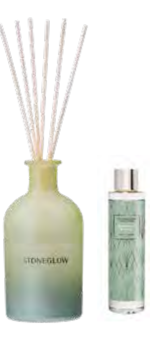
70025 Reed Diffuser Refill 200ml 16 weeks (pk/6)