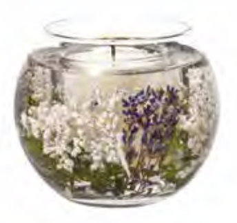
6535 Natural Wax Fishbowl 100mm Dia 15 hrs (reusable) (pk/4)