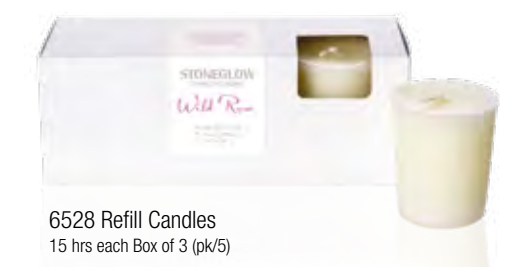
STONI GLOW Wild Rose