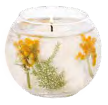
70039 Natural Wax Fishbowl 100mm Dia 15 hrs (reusable) (pk/4)