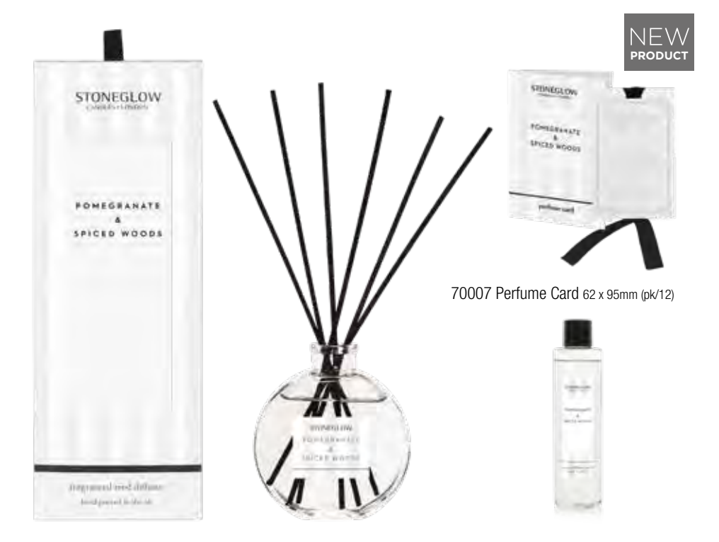
6896 Reed Diffuser 120ml 12 weeks (pk/6)