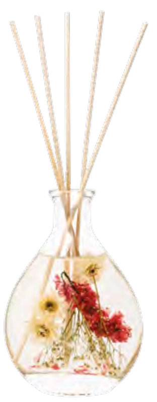
6848 Reed Diffuser 200ml 16 weeks (pk/6)