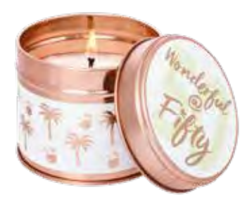
Fragrance: Pomegranate 6794 Candle Tin 78 x 75mm 25 hrs (pk/6)