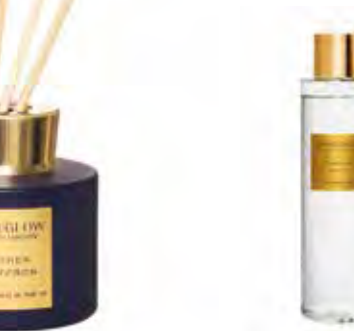
6126 Reed Diffuser 120ml 10 weeks (pk/6)