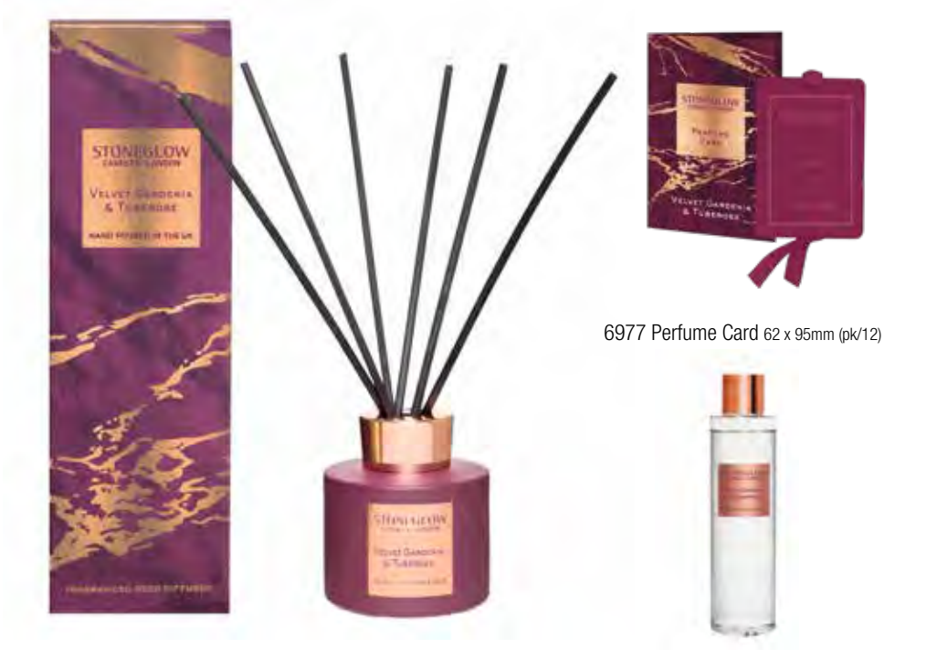
6890 Reed Diffuser 120ml 10 weeks (pk/6)