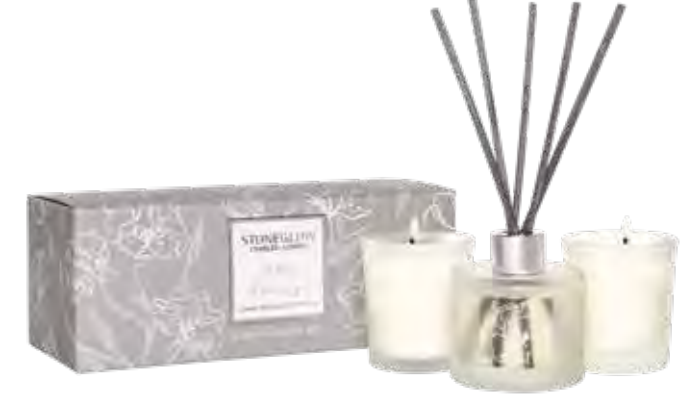
Gift Set 2 x 5cl candles 8 hrs each & 1 x 45ml Diffuser (pk/4)

Tumbler 6623 Reed Diffuser 6624 Refill 6625 Room Spray 6772 Gift Set 6651