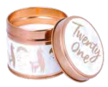
Fragrance: Blackberry 6903 Candle Tin 78 x 75mm 25 hrs (pk/6)