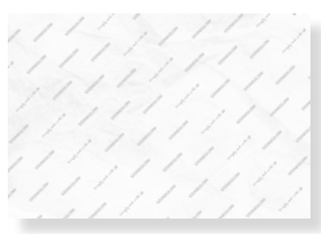
TISSUE PAPER PAC-SGPAPER (500 sheets) Dimensions 750mm x 500mm