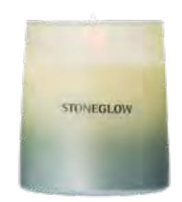
70024 Tumbler 95 x 85mm 35 hrs (pk/6)