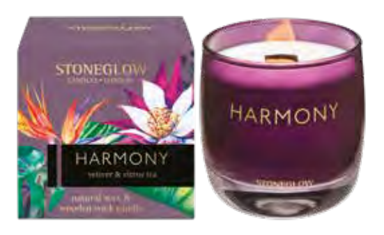
6688 Tumbler 80 x 78mm 35 hrs (pk/6)

An aromatic infusion with tea notes of bergamot and lemon blended in a fragrant heart of lily of the valley, rosemary, mint, sage and basil. Spicy cardamom and black pepper combine with a base of vetiver, cedar and musk.