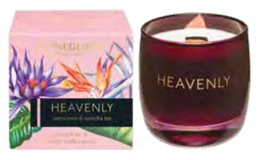
6697 Tumbler 80 x 78mm 35 hrs (pk/6)

Powdery orris root complements the freshness of matcha tea whilst subtle wisps of smoky woods and incense permeate throughout. An earthy, rooty and dusty base woven from patchouli, vetiver and balsams leaves a lingering trail.