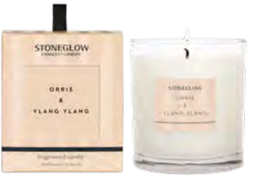
6820 Tumbler 90 x 80mm 40 hrs (pk/6)

Oriental floral with seductive top notes of bergamot, plum and iris, on a heart of rose, jasmin, ylang and orris and a base of amber, vetiver, woody musks.