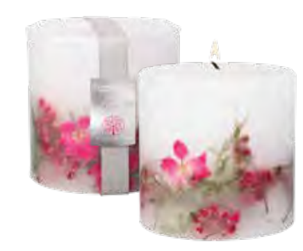
6756 Pillar Candle 95 x 95mm 60 hrs (pk/4)