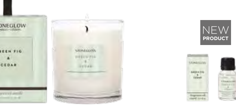
70018 Fragrance Oil 15ml (pk/12)