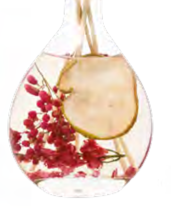
6851 Reed Diffuser 200ml 16 weeks (pk/6)

A wonderful floral accord opening with delicate bergamot, mandarin and grapefruit top notes, balanced with a heart of apple blossom, white rose, water lily and gardenia wrapped in musk and fine woods.