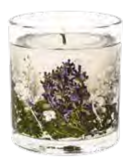
6533 Natural Wax Tumbler 90 x 80mm 15 hrs (reusable) (pk/6)