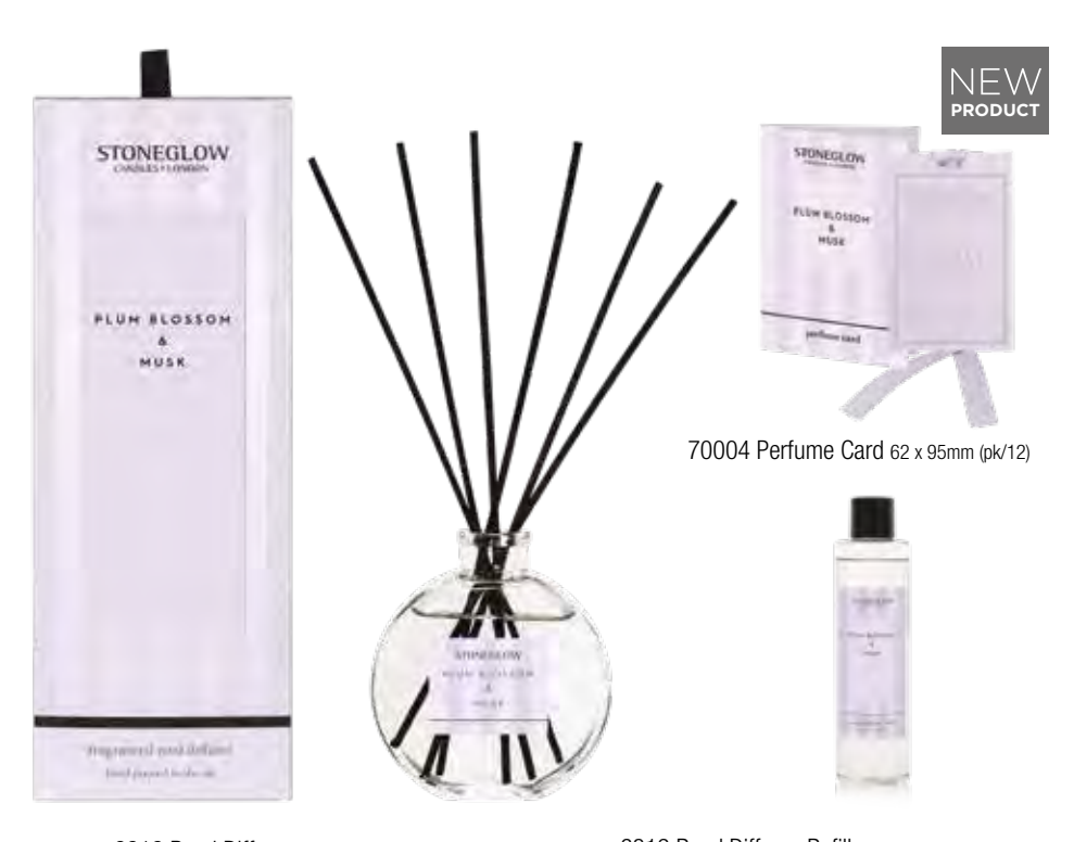
6818 Reed Diffuser 120ml 12 weeks (pk/6)