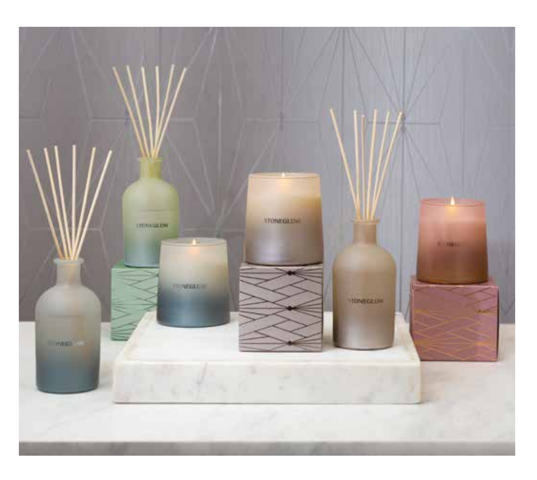
Lovingly made in the UK