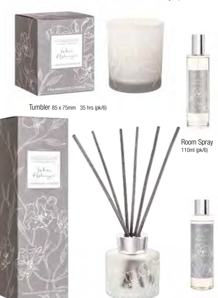
Reed Diffuser 120ml 10 weeks (pk/6)