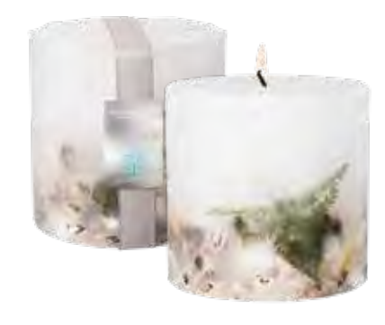
6754 Pillar Candle 95 x 95mm 60 hrs (pk/4)