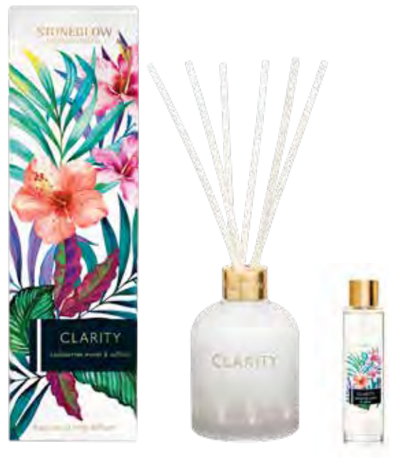
6704 Reed Diffuser 150ml 12 weeks (pk/6)