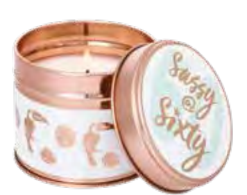
Fragrance: Pomegranate 6795 Candle Tin 78 x 75mm 25 hrs (pk/6)