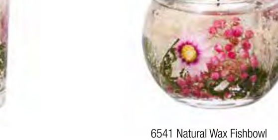
100mm Dia 15 hrs (reusable) (pk/4)