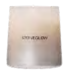
70033 Tumbler 95 x 85mm 35 hrs (pk/6)