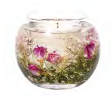
6530 Natural Wax Fishbowl 100mm Dia 15 hrs (reusable) (pk/4)