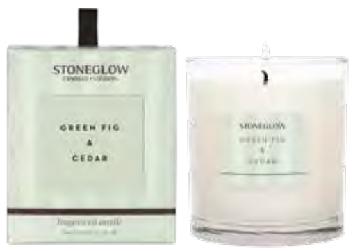
6832 Tumbler 90 x 80mm 40 hrs (pk/6)

A sumptuous fragrance of fresh figs is enlivened by tangy orange and grapefruit accords. A smooth base of rich woods and coconut milk adds warmth and depth.