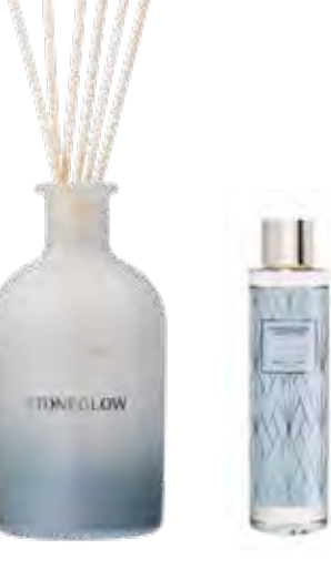
70022 Reed Diffuser Refill 200ml 16 weeks (pk/6)