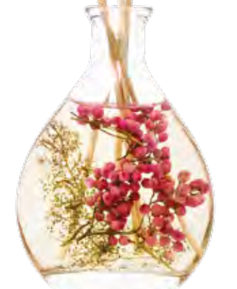
6862 Reed Diffuser 200ml 16 weeks (pk/6)