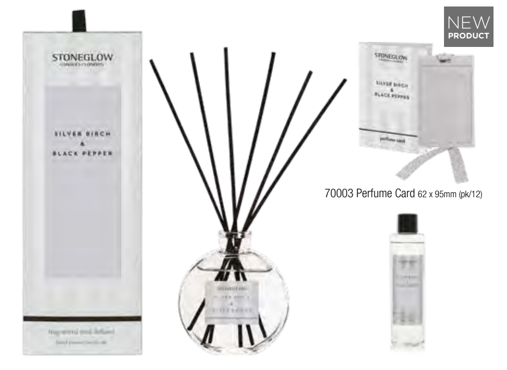
6814 Reed Diffuser 120ml 12 weeks (pk/6)