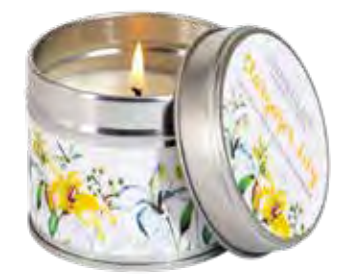
70043 Natural Wax Candle Tin 78 x 75mm 25 hrs (pk/6)