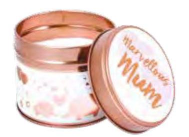
Fragrance: Cranberry 70053 Candle Tin 78 x 75mm 25 hrs (pk/6)