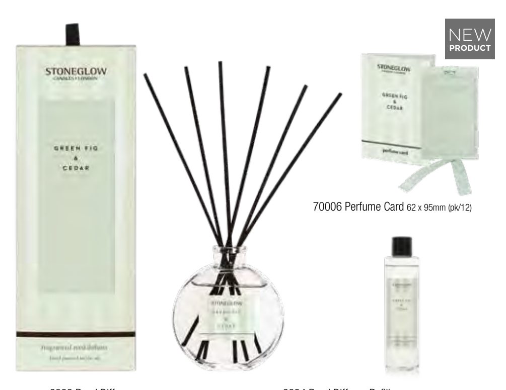
6833 Reed Diffuser 120ml 12 weeks (pk/6)