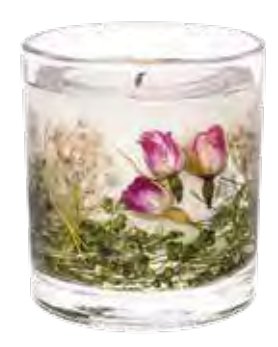
6527 Natural Wax Tumbler 90 x 80mm 15 hrs (reusable) (pk/6)