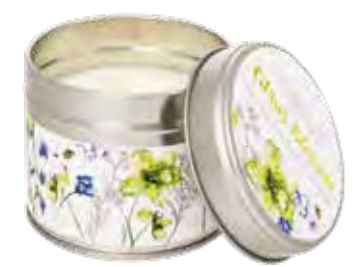
6835 Natural Wax Candle Tin 78 x 75mm 25 hrs (pk/6)