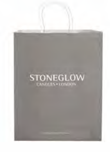
GIFT BAGS Grey gift bags with white rope handles. BAG-SG15 (sold in 15's) Dimensions 240mm x 110mm x 310mm