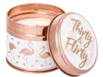
Fragrance: Grapefruit & Lime 6792 Candle Tin 78 x 75mm 25 hrs (pk/6)