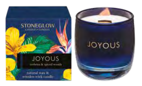
6700 Tumbler 80 x 78mm 35 hrs (pk/6)

Zingy verbena, lemon, lime and grapefruit are balanced by delicious orchard fruits. Cinnamon and clove bring warmth whilst a rich patchouli base note brings a touch of the exotic.