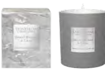
6664 Tumbler 90 x 80mm 40 hrs (pk/6)