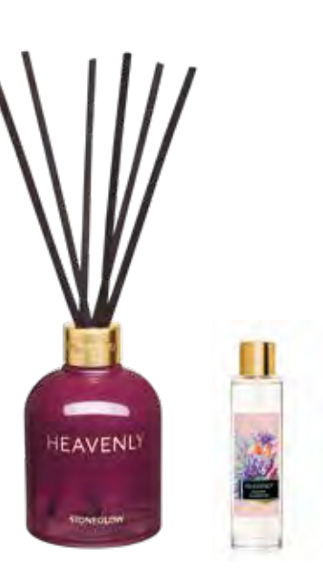
6699 Reed Diffuser Refill 200ml 16 weeks (pk/6)