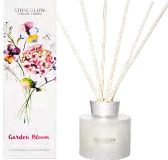
6538 Reed Diffuser 120ml 10 weeks (pk/6)