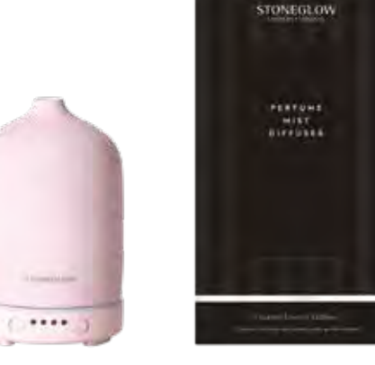
70008 Perfume Mist Diffuser 90mm x 90mm x 150mm each (pk/4)

70067 Perfume Mist Diffuser – Mixed Case of 4 – 1 of each design 90mm x 90mm x 150mm each (pk/4)