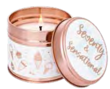
Fragrance: Grapefruit & Lime 6796 Candle Tin 78 x 75mm 25 hrs (pk/6)