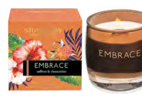
6886 Tumbler 80 x 78mm 35 hrs (pk/6)

Fresh top notes of bergamot and citrus blend beautifully with aromatic green accords of rosemary, lavender and saffron. Warm and woody cedar, amber and patchouli, along with sweet vanilla, bring a musky depth to this delightful fragrance.