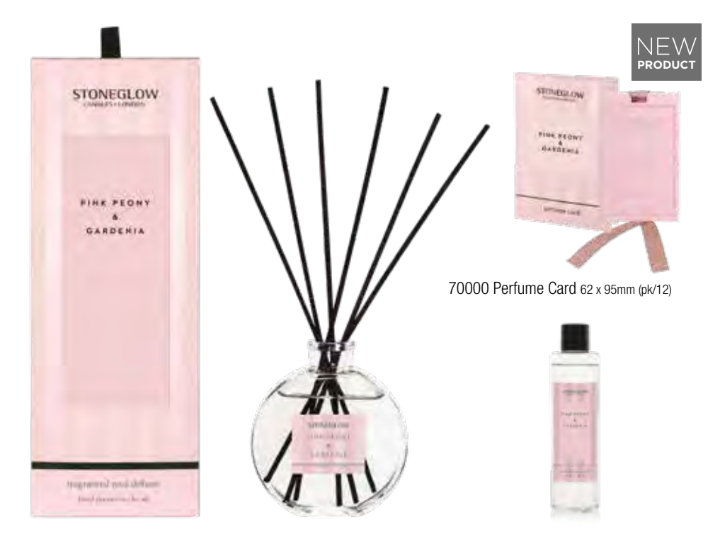
6806 Reed Diffuser 120ml 12 weeks (pk/6)