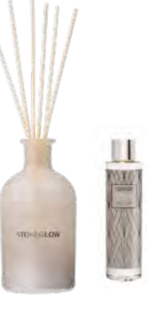
70034 Reed Diffuser Refill 200ml 16 weeks (pk/6)