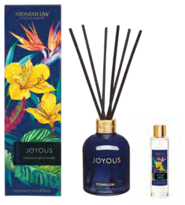
6701 Reed Diffuser 150ml 12 weeks