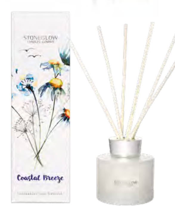
6550 Reed Diffuser 120ml 10 weeks (pk/6)