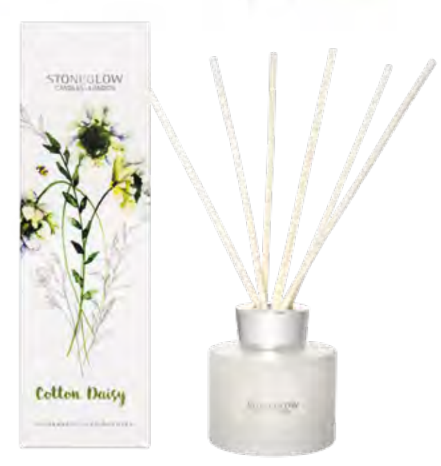
6544 Reed Diffuser 120ml 10 weeks (pk/6)