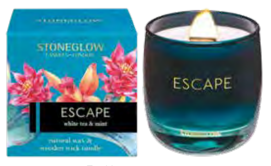
6844 Tumbler 80 x 78mm 35 hrs (pk/6)

Infused with white tea, hints of berries, and zesty citrus, nestled on leafy mint leaves, this fresh scent will deliver an elements of tranquillity and escapism.