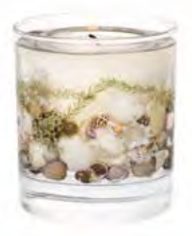
6551 Natural Wax Tumbler 90 x 80mm 15 hrs (reusable) (pk/6)