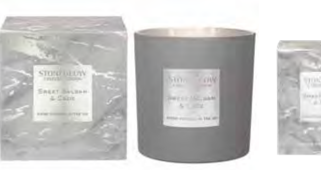
6880 3-Wick 120 x 120 mm 85 hrs (pk/2)

Creamy vanilla and sweet balsam bring a woody, mellow warmth whilst the geranium and lavender heart lift and inspire. Tonka bean, frankincense and cade add depth and sophistication.