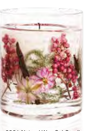
6861 Natural Wax Gel Candle 120 x 100mm 30 hrs (pk/2)

A delightful floral blend of muguet, rose and geranium with a distinctive pink pepper twist. Notes of ginger and elemi bring a touch of class to this lovely modern fragrance.