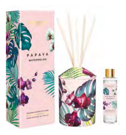
6867 Reed Diffuser 200ml 16 weeks (pk/6)