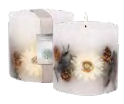
6948 Pillar Candle 95 x 95mm 60 hrs (pk/4)