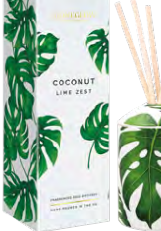
6869 Reed Diffuser 200ml 16 weeks (pk/6