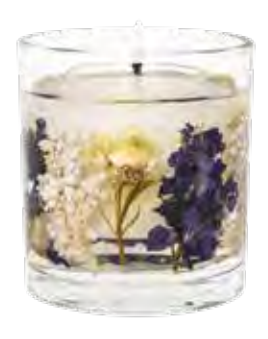
6826 Natural Wax Tumbler 90 x 80mm 15 hrs (reusable) (pk/6)