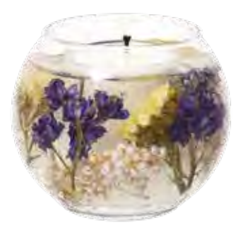
6827 Natural Wax Fishbowl 100mm Dia 15 hrs (reusable) (pk/4)