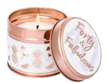
Fragrance: Pineapple & Tangerine 6793 Candle Tin 78 x 75mm 25 hrs (pk/6)