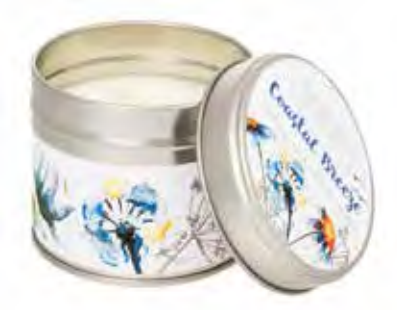
6837 Natural Wax Candle Tin 78 x 75mm 25 hrs (pk/6)