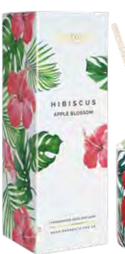
6868 Reed Diffuser 200ml 16 weeks (pk/