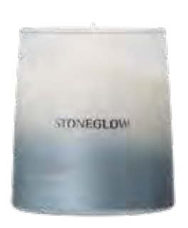
70021 Tumbler 95 x 85mm 35 hrs (pk/6)