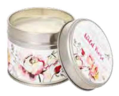
6839 Natural Wax Candle Tin 78 x 75mm 25 hrs (pk/6)