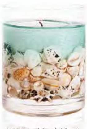
6858 Natural Wax Gel Candle 120 x 100mm 30 hrs (pk/2)

An uplifting, refreshing ozonic fragrance. Freshly cut lavender stems and green oakmoss sit on a warm, woody base of white cedarwood and soft musks.