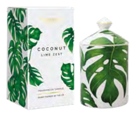
6873 Tumbler 150 x 85mm 60 hrs (pk/6)

Zingy lime and tropical coconut enliven and lift. Delicate violet leaf brings a floral subtlety whilst warm, sensuous vanilla and tonka bean give a depth and mellowness to this fragrance.