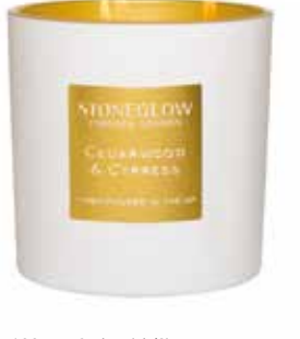
6881 3-Wick 120 x 120 mm 85 hrs (pk/2)