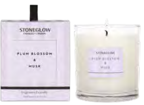
6817 Tumbler 90 x 80mm 40 hrs (pk/6)

A succulent fruity accord with opening notes of plum, pear and melon. Fragrant floral notes of lily and freesia are entwined with sensuous musks.