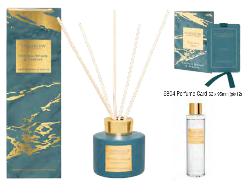
6784 Reed Diffuser 120ml 10 weeks (pk/6)