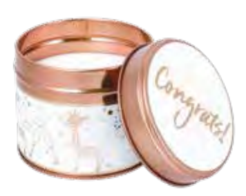
Fragrance: Blackberry 6904 Candle Tin 78 x 75mm 25 hrs (pk/6)