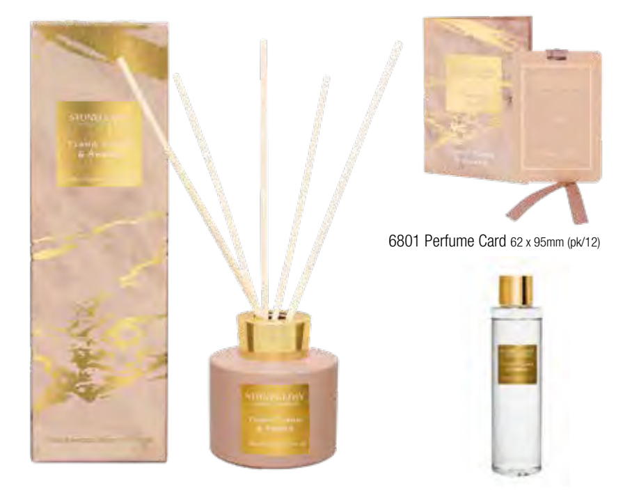
6515 Reed Diffuser 120ml 10 weeks (pk/6)