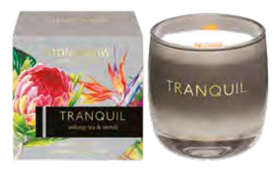
6694 Tumbler 80 x 78mm 35 hrs (pk/6)

Delicate notes of oolong tea, infused with bergamot and mandarin, are lightly combined with bamboo, lemongrass and bitter sweet neroli, creating a fragrance for relaxation.