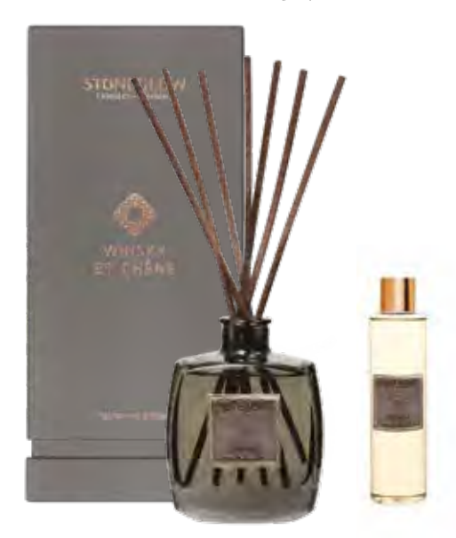
6671 Reed Diffuser 200ml 16 weeks (pk/6)