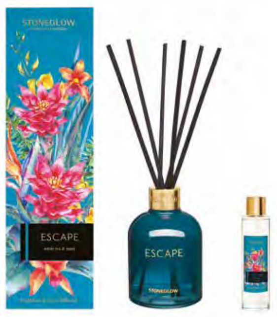
6845 Reed Diffuser 68 150ml 12 weeks 200 (pk/6) (pk