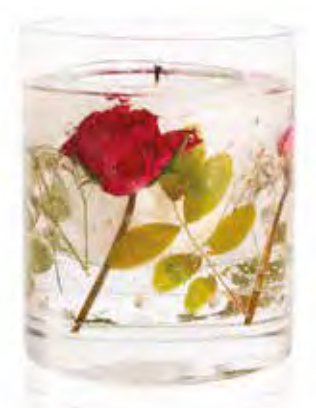
6864 Natural Wax Gel Candle 120 x 100mm 30 hrs (pk/2)

A beautiful bouquet of deep red rose petals and rich geranium blooms. Soft powdery notes and a sultry musk base give this timeless classic a sexy, modern twist.