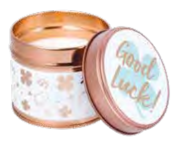
Fragrance: Green Apple 6905 Candle Tin 78 x 75mm 25 hrs (pk/6)