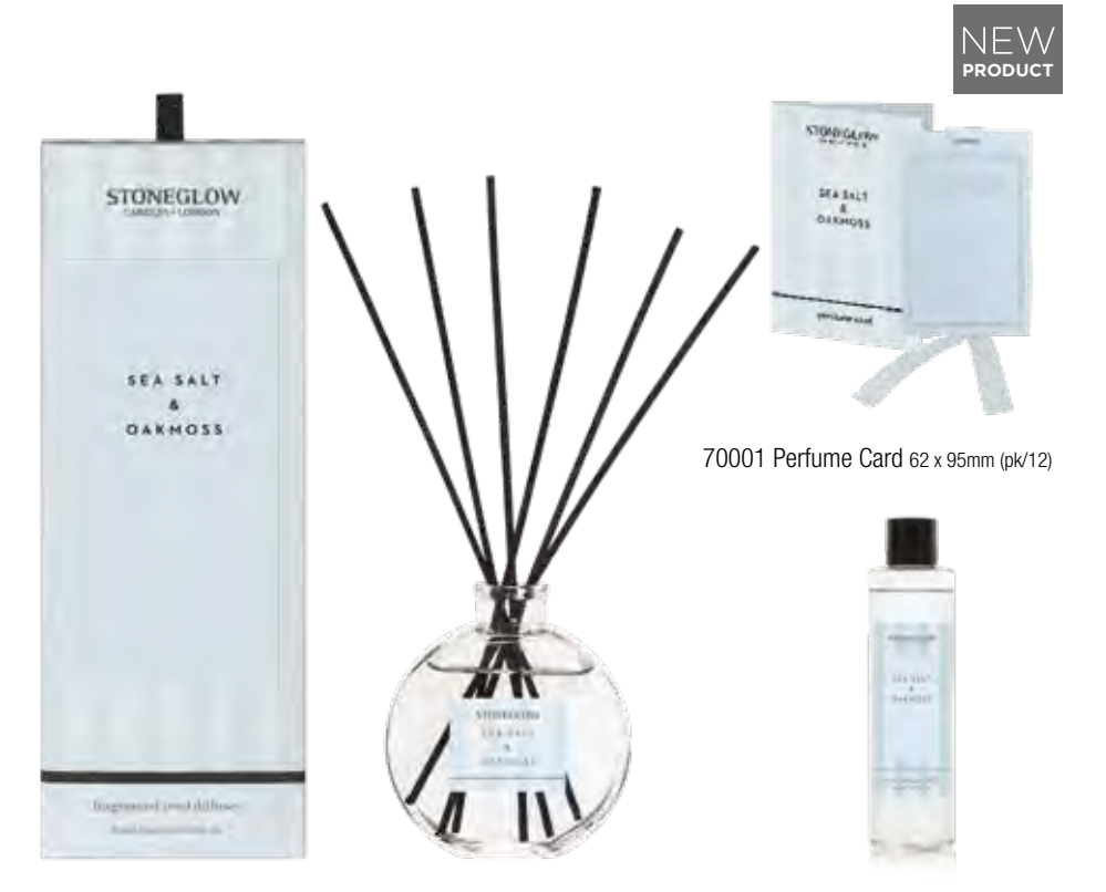
6809 Reed Diffuser 120ml 12 weeks (pk/6)