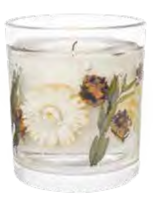
6947 Natural Wax Gel Candle 120 x 100mm 30 hrs (pk/2)

Dark and enigmatic amber, balsam and decadent woods layered with precious florals jasmine and rose brushed with sultry spices of ginger and cardamom create an opulent and mysteriously rich oriental composition.