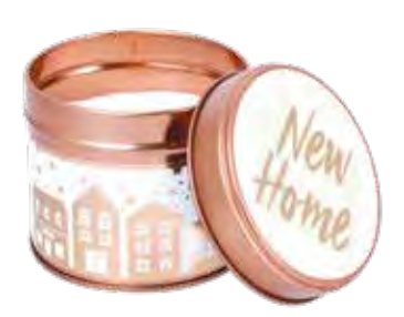
Fragrance: Green Apple 6906 Candle Tin 78 x 75mm 25 hrs (pk/6)

70066 Milestone Events Tins – Mixed Case of 18 – 3 of each design 78 x 75mm 25 hrs (pk/18)