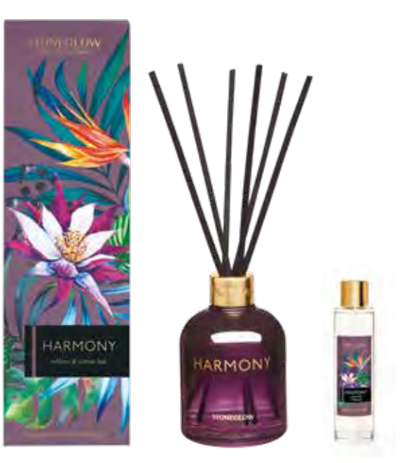
6689 Reed Diffuser 150ml 12 weeks (pk/6)