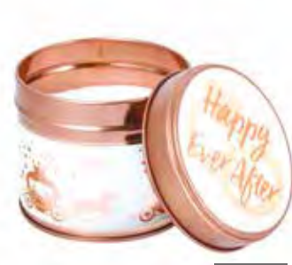
Fragrance: Cranberry 70055 Candle Tin 78 x 75mm 25 hrs (pk/6)