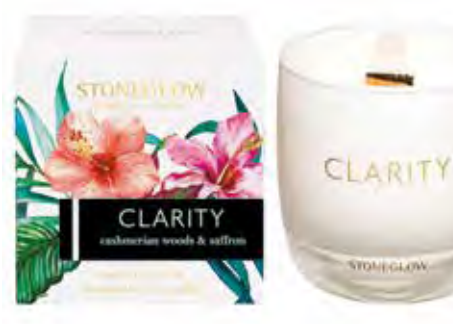
6703 Tumbler 80 x 78mm 35 hrs (pk/6)

A distinctive and spicy mix of cinnamon, clove and saffron sits on a floral heart of roses and white blooms. The rich woody base of vetiver, sandalwood and patchouli is softened with warming cashmere musk and moss.