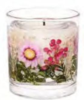
6539 Natural Wax Tumbler 90 x 80mm 15 hrs (reusable) (pk/6)